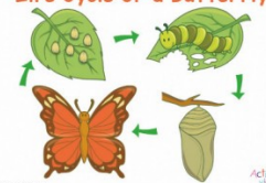
Life Cycle of a Butterfly